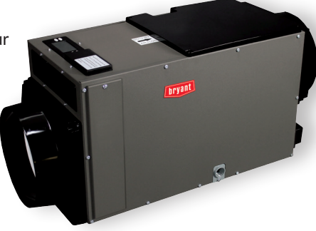
A built-in "clean filter" indicator tells you when it's time to change the filter.

Keeping humidity under wraps can also improve the quality of the air you breathe by keeping mold and some allergens under control.* It can help prevent warping or structural damage to wood flooring or furnishings. And, setting your dehumidification levels is simple and convenient using the LCD control that can remain on the dehumidifier cabinet or installed at a more easily accessed location.